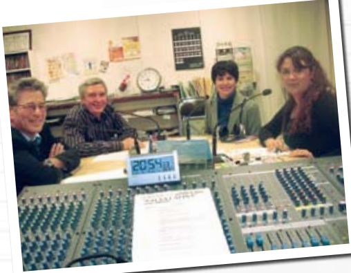
⑭An impromptu appearance on a FM broadcast at the Center FM 番組(FM わいわい)への生出演