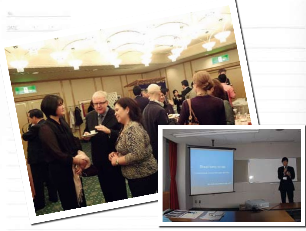
®Welcome Reception レセプション